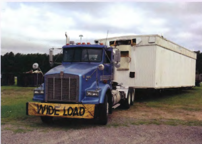
Trailer being removed from SRS by SRSCRO subcontractor, Bolin Marketing Group.

The mission of the SRS Community Reuse Organization is to facilitate economic development opportunities associated with Savannah River Site technology, capabilities and missions and to serve as an informed, unified community voice for the five-county, two-state region.