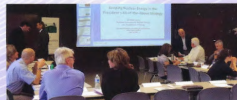
DOE community representatives from across the nation at ECA peer exchange