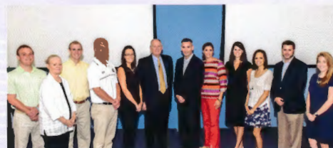
Congressional Staffers enjoying a tour of SRS

In addition, the SRSCRO helped the Energy Communities Alliance (ECA) host a Peer Exchange on Advancing Nuclear Priorities for approximately 50 ECA members, officials from the Department of Energy's (DOE) offices of Nuclear Energy and Environmental Management, and officials from other local governments visiting the SRS area. The peer exchanges bring together leaders from communities impacted by DOE activities to provide the opportunity to explore issues impacting their communities. The program's core is "peer matching," built around an interaction strategy.