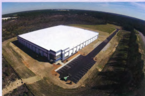
SRSCRO funds helped with initial infrastructure for a 100,000-square-foot industrial spec building in Sage Mill Industrial Park