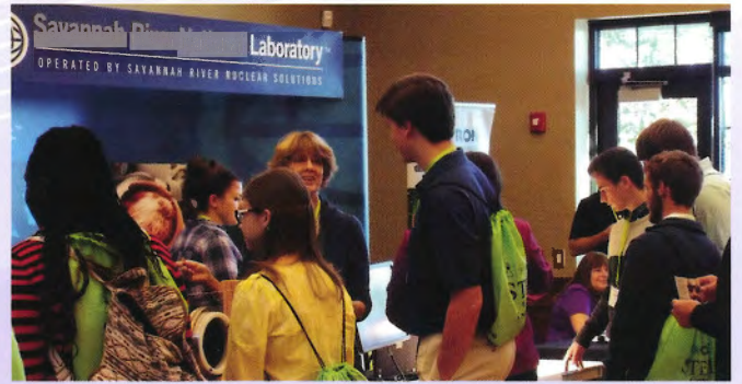
Students learn how technology relates to local jobs at STEM Career Connections.

NWI® partners are particularly focused on ensuring that people of the greater SRSCRO region have an opportunity to develop the skills needed for regional nuclear industry jobs, something we call "Growing Our Own Through Collaboration®."