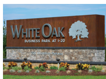
White Oak Business Park Columbia County, GA 612 acres