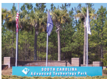
SC Advanced Technology Park Barnwell County, SC 2,300 acres