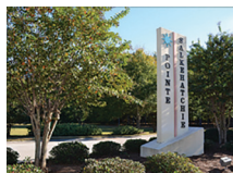
Pointe Salkehatchie Industrial Park Allendale County, SC 120 acres