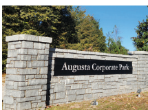
Augusta Corporate Park Richmond County, GA 1,597 acres