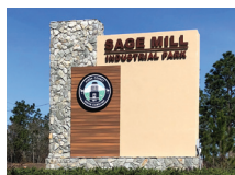
Sage Mill Industrial Park Aiken County, SC 1,730 acres